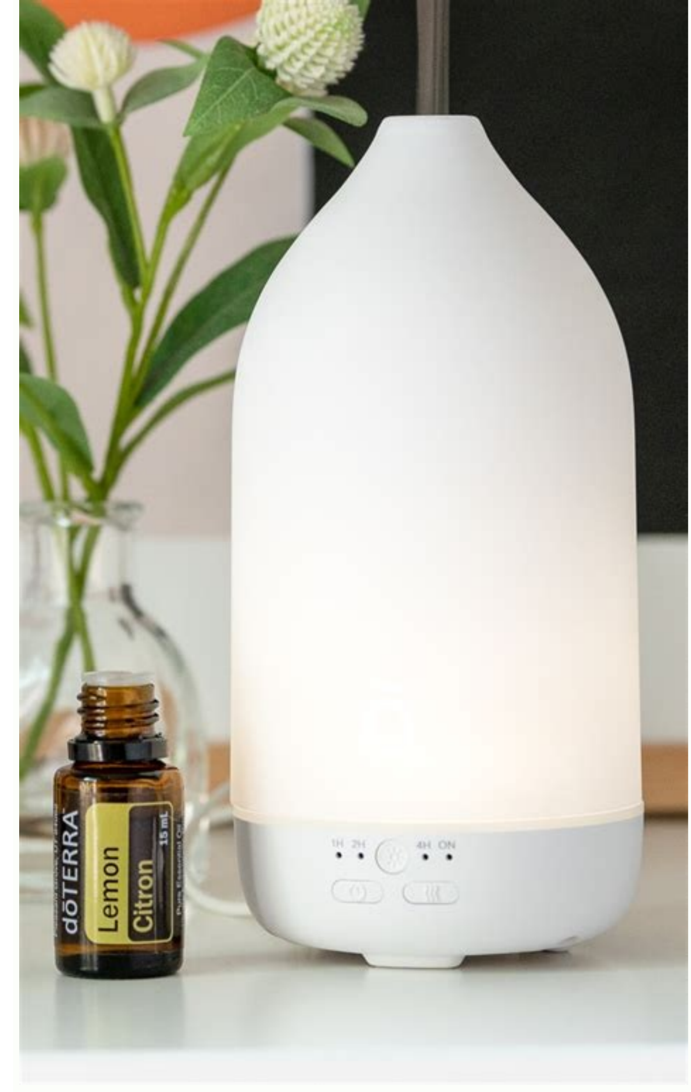
Best essential oil diffuser sticks. How to make essential oil diffuser sticks. Natural essential oil diffuser sticks. Essential oil diffuser sticks diy. Can you use essential oils with diffuser sticks. Essential oil diffuser bamboo sticks. What are the best essential oils to put in a diffuser. What essential oils should not be used in a diffuser.